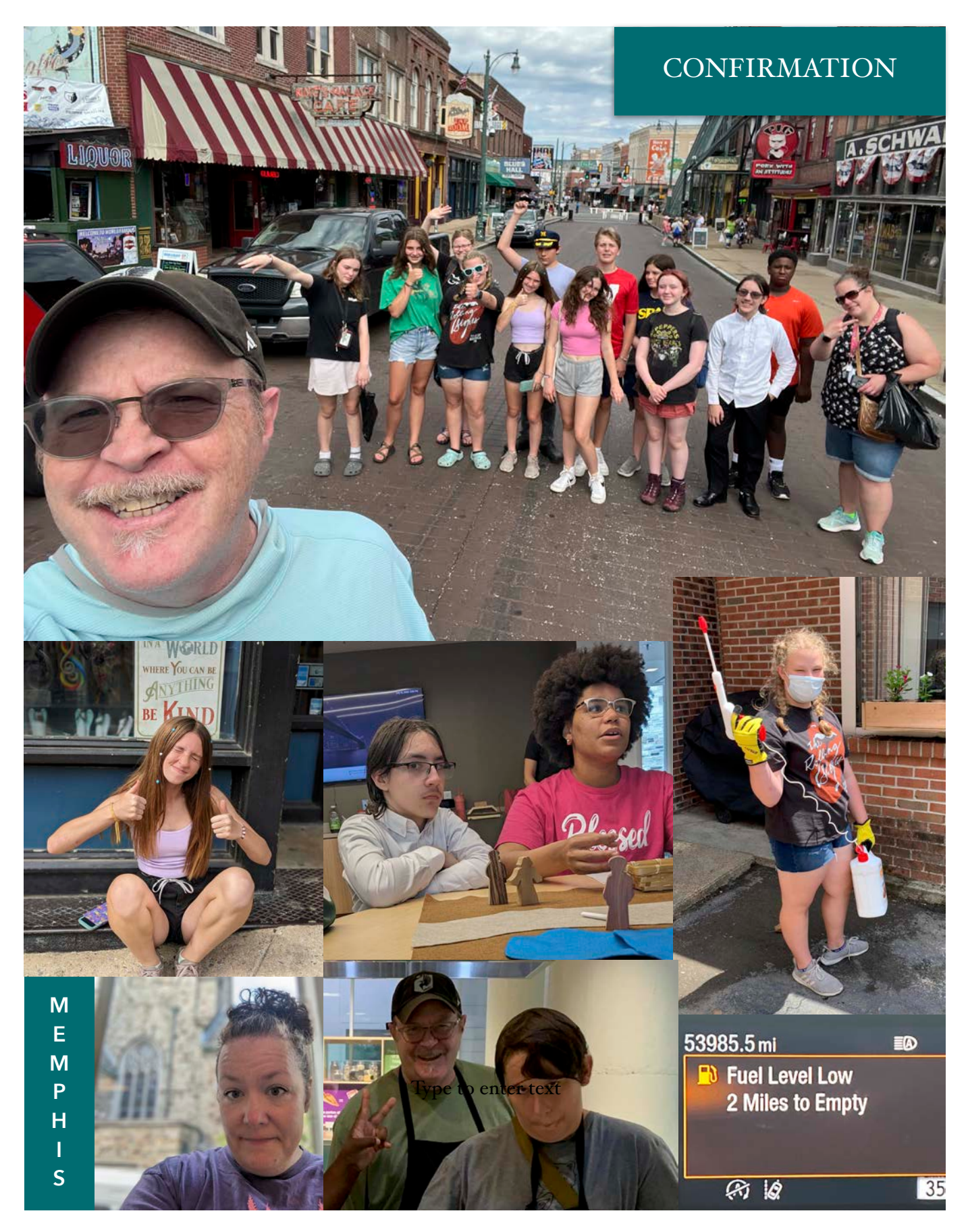
Thank you to everyone who made our Confirmation Trip to Memphis possible. Your prayers, support and financial gifts were a blessing to all of us.