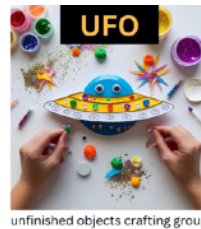
unfinished objects crafting group

Our friends at Our Redeemer Lutheran (1390 Larpenteur) invite us to join them for U.F.O Crafting Day , the 3rd Saturday of each month from 8 am—4 pm in the ORLC Fellowship Hall. The next U.F.O. is scheduled for Saturday January 17th . Bring your Unfinished Objects and meet new people as you tackle that crafting project that you've been wanting to get started or finished but needed a boost from other friendly crafters! Meals are on your own; but there's is a refrigerator and microwave for your use.