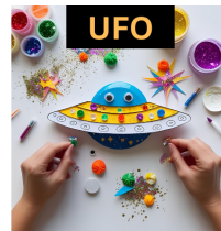
unfinished objects crafting group

Our friends at Our Redeemer Lutheran (1390 Larpenteur) invite us to join them for U.F.O Crafting Day , the 3rd Saturday of each month from 8 am—4 pm in the